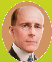
Rtn. Paul Harris Founder